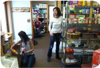
General Services Path

The Family Pathways Framework is a guide that outlines three primary paths through which families receive services from Family Resource Centers, each with increasing intensity of service provision and required data tracking.