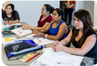
Center Services Path